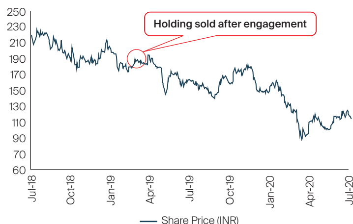
Jyothy Labs Share Price

2019 Conclusion – “It is a shame that a good business will be destroyed because the family is adamant to maintain its control, just so that each of them has something to do. A shocker of a meeting with the next CEO.”