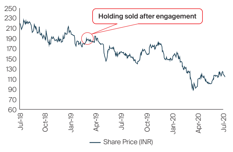
Jyothy Labs Share Price

2019 Conclusion – "It is a shame that a good business will be destroyed because the family is adamant to maintain its control, just so that each of them has something to do. A shocker of a meeting with the next CEO."