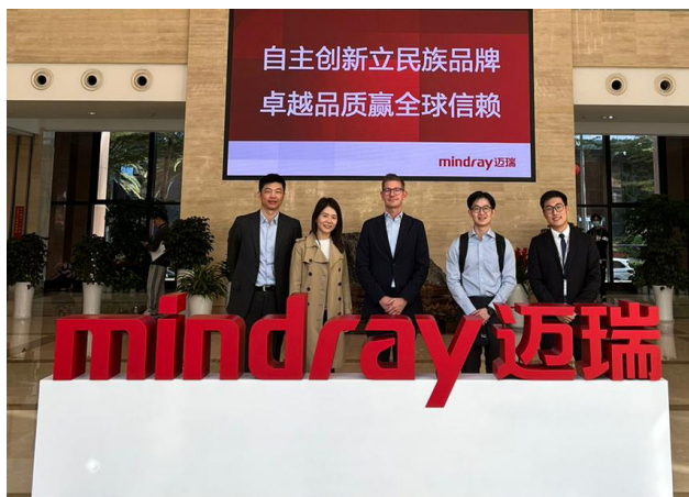
Photo from the FSSA team's visit to Shenzhen in February, at Mindray's office.